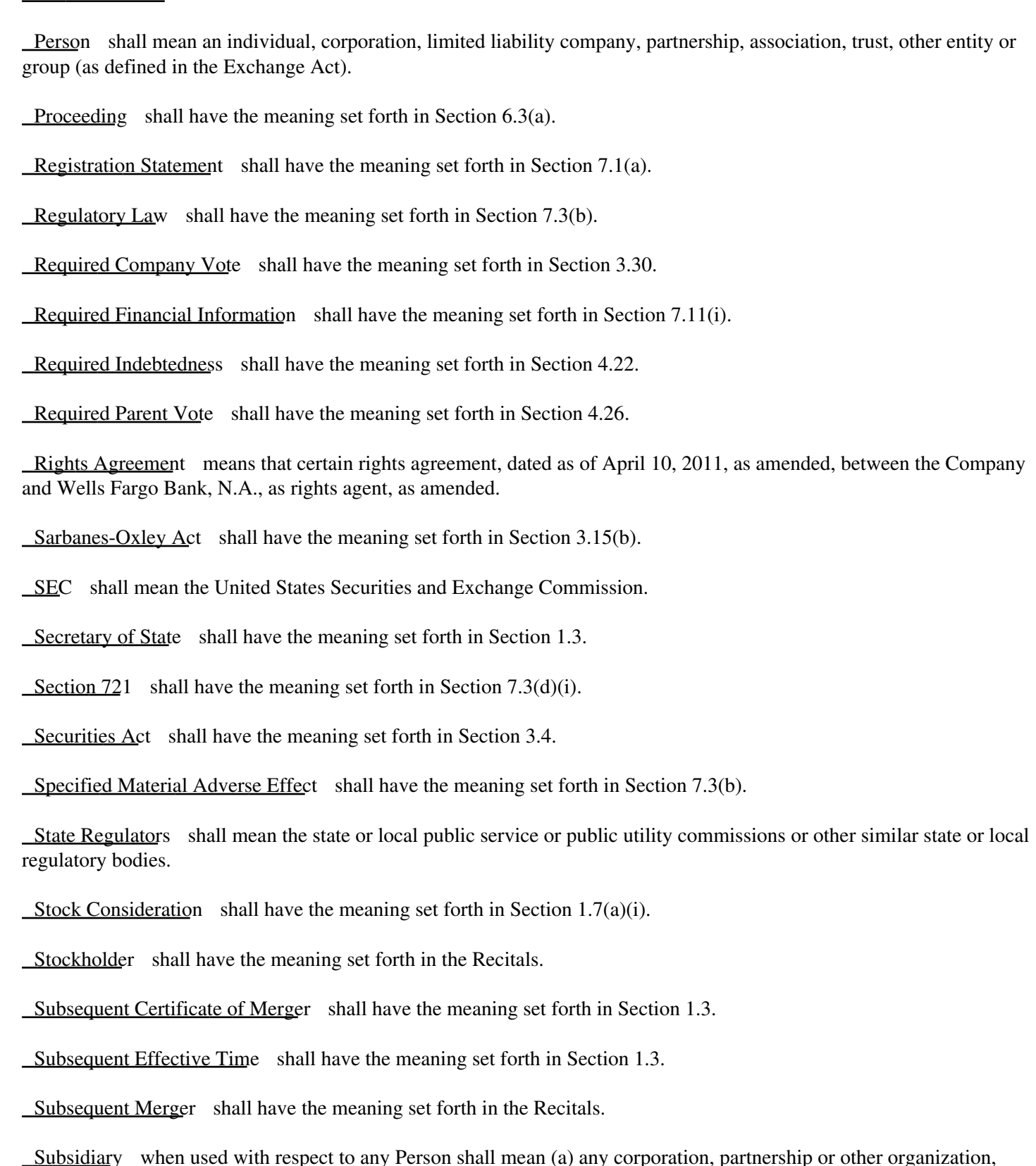
Table of Contents 566

whether incorporated or unincorporated, (i) of which such Person or any other Subsidiary of such Person is a general partner (excluding partnerships, the general partnership interests of which held by such Person or any Subsidiary of